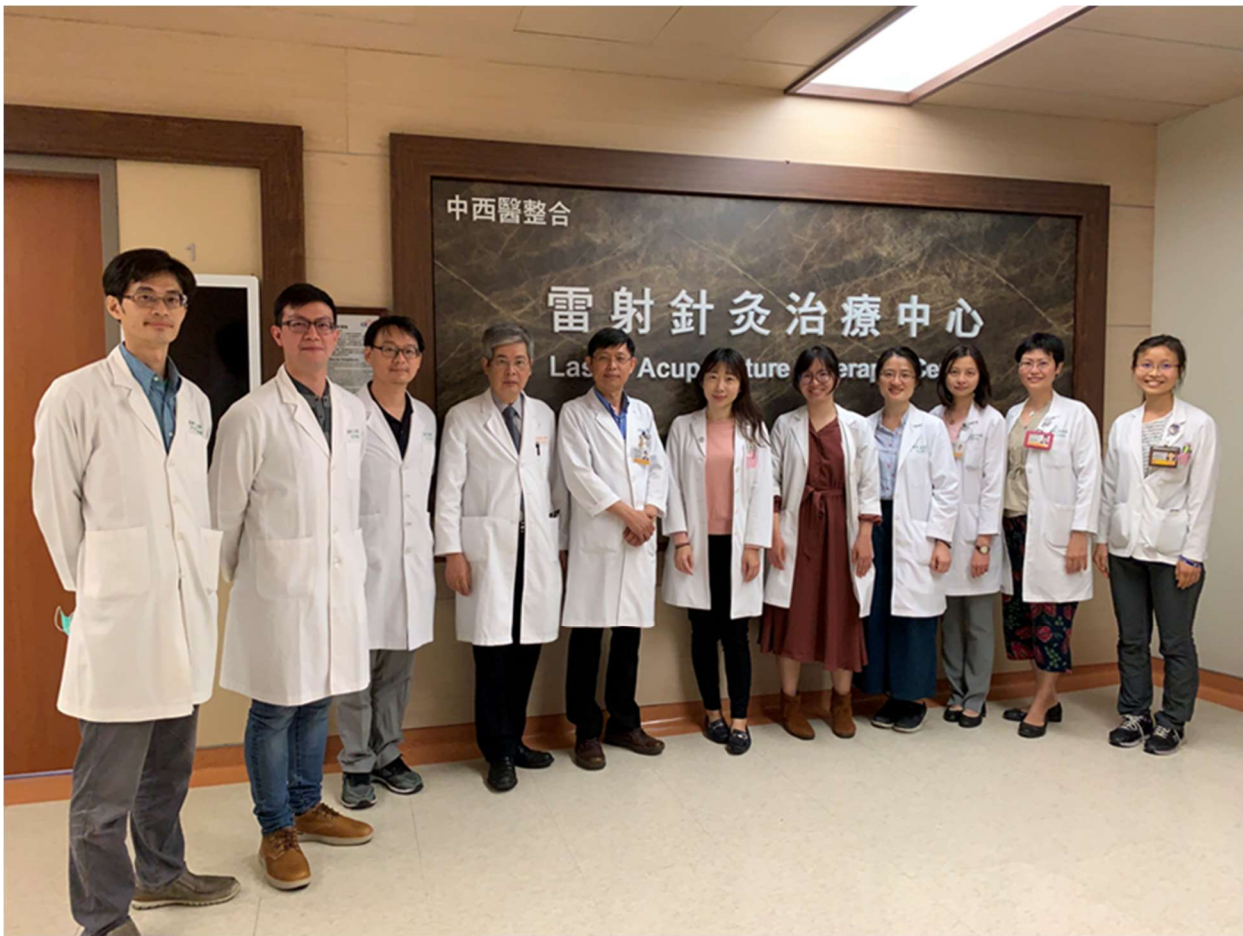
Figure 4 Team of Laser Acupuncture Study