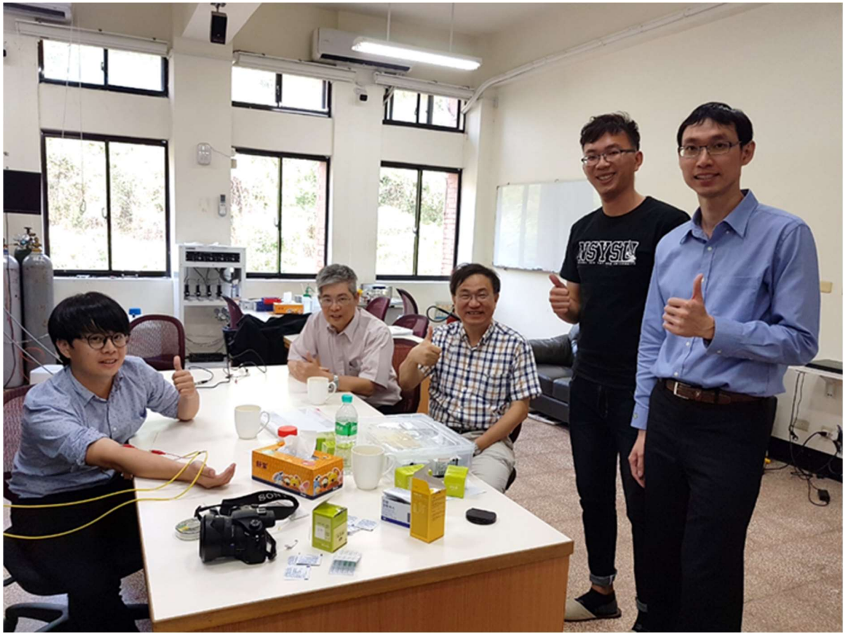
Figure 3 Research of Acupuncture and Meridian