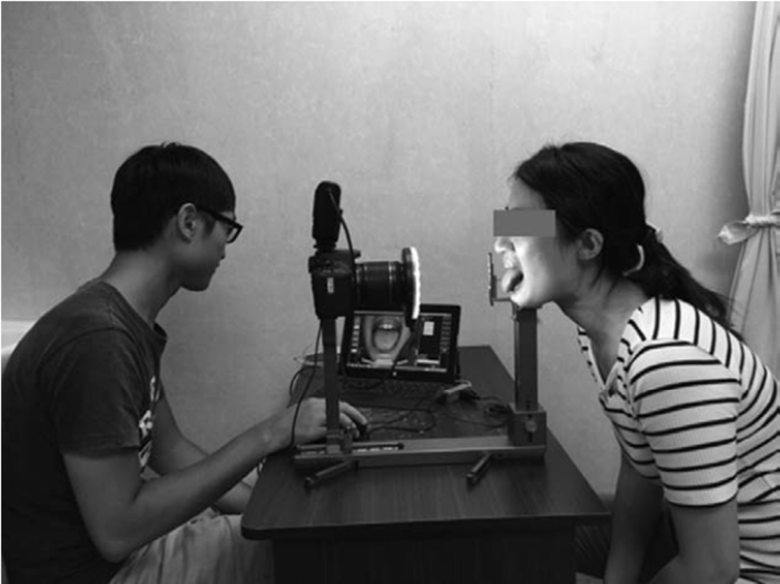
Figure 2 Tongue Image Study